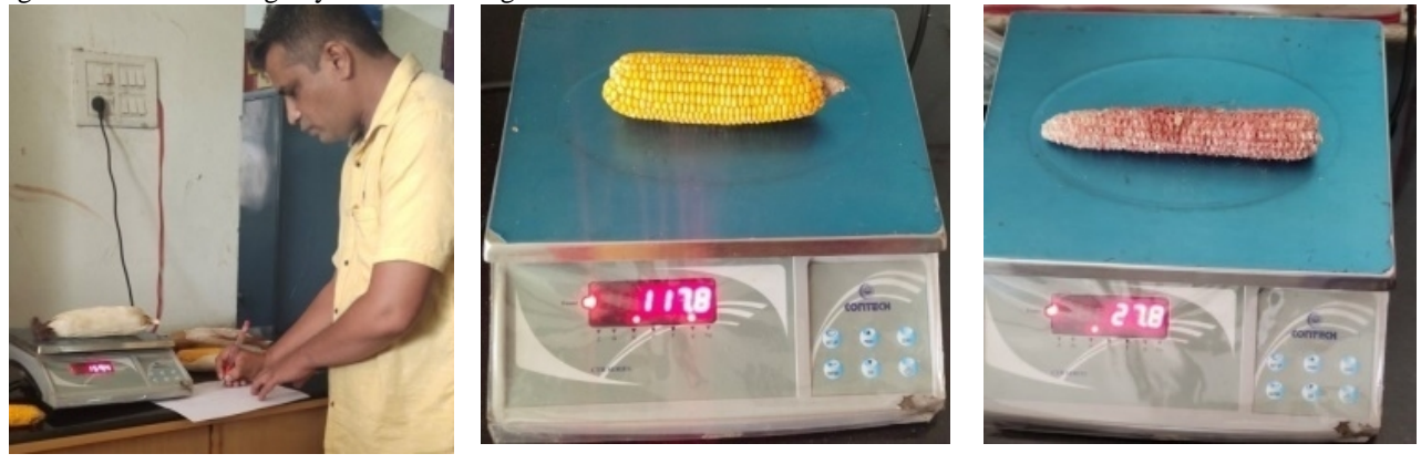
(a) With husk

Where, W_g = Weight of grain from sample, g; and W_t = Weight of total maize cob sample, g.