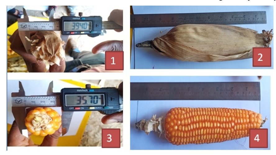
Fig. 1. Measurement of the dimensions of whole (1 and 2) and dehusked maize cob (3 and 4).

grain lines in a cob, number of grains in one line of a cob, minimum diameter of a cob without grains (mm), maximum diameter of a cob without grains (mm), average length of a shelled cob (mm), diameter of an whole cob (mm), and shape (Tarighi et al. , 2011). Fig. 1 illustrate the measurement of the dimensions of both whole cob and maize grain respectively.